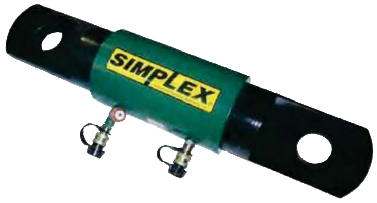
RDP506 Shown See table for additional models

The Simplex RDP506 is used by this manufacturer of heavy steel cables. "We do numerous pull tests everyday; the Simplex equipment is fast and reliable".