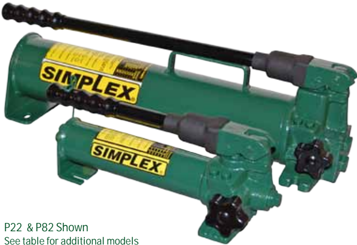
P22 & P82 Shown See table for additional models