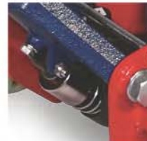
ANGULAR PUMP PISTON FEATURE

U.S. PATENT NO. D483,169 and 7,036,796 B2