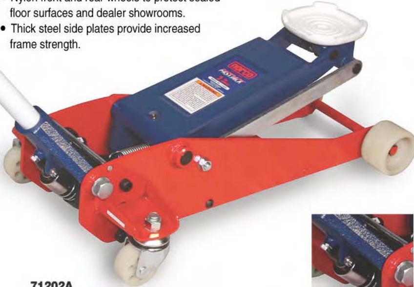
71202A (2 TON)

U.S. PATENT NO. D483,169 and 7,036,796 B2