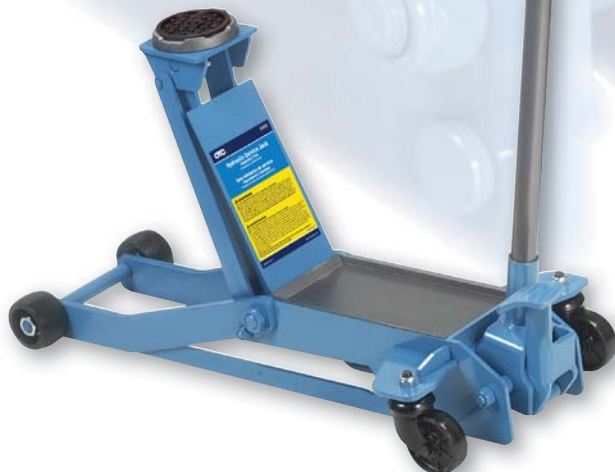
No. 5202 – 2-Ton Service Jack.