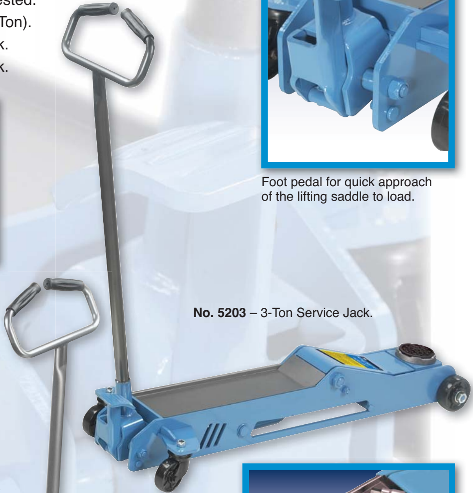
No. 5203 – 3-Ton Service Jack.

Foot pedal for quick approach of the lifting saddle to load.